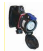
Female Receptacle with Wall Box 22-34043 + 22-3A023-34-T