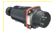
Male Inlet with Handle (Plug) 22-38043 + 22-3A013-25P

A typical order should include an inlet part number, a receptacle part number AND the matching handles, angles or other required accessories.